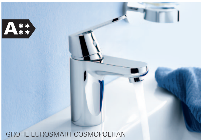
GROHE EUROSMA RT COSMOPOLITAN