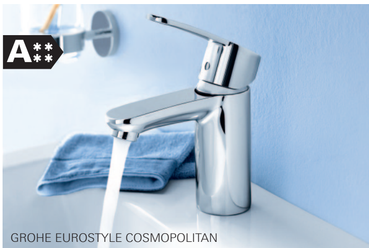
GROHE EUROSTYLE COSMOPOLITAN