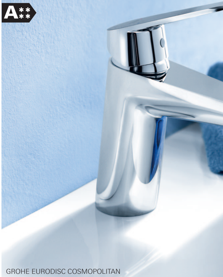
GROHE EURODISC COSMOPOLITAN